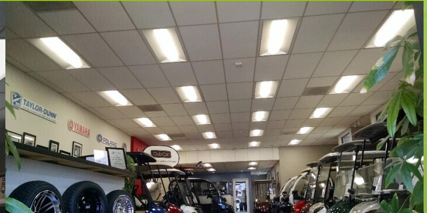
AFTER – 45 Watt LED 2x4 Troffer