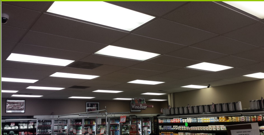
Before – 4 Lamp T8 Troffer 98W