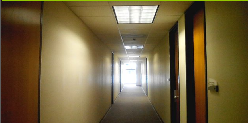
BEFORE – 90 Watt T8 2x4 Troffer