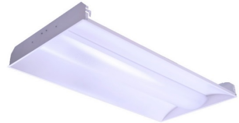
LED ANGLE Troffer