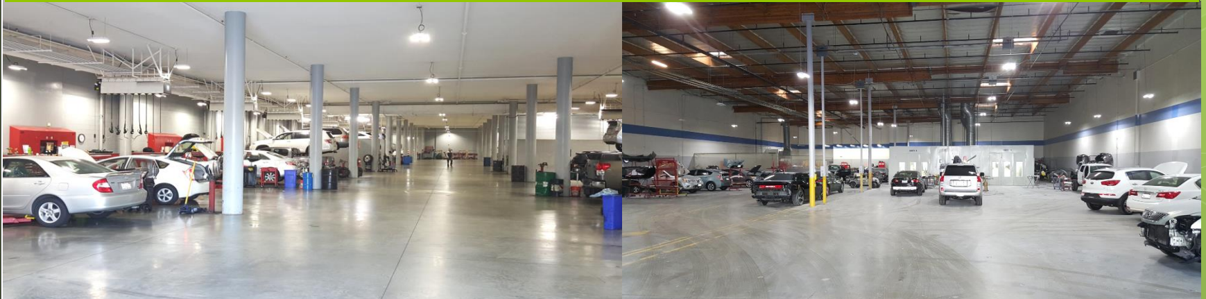
AFTER – 110W LED High Bay