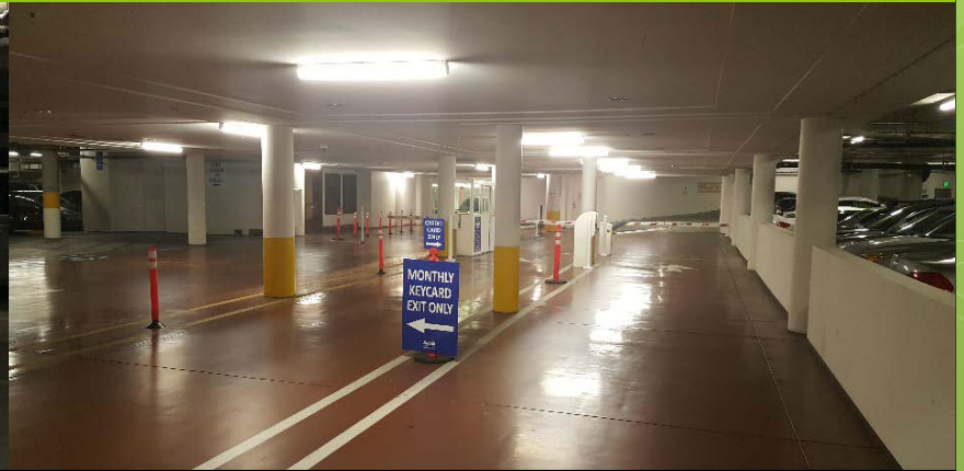
After – 42W LED Radial Fixtures