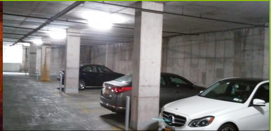
After – 37W LED