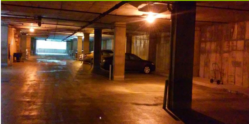
Before – 150W HPS