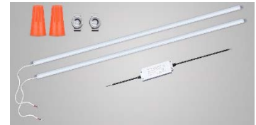
LED Troffer Kit ENV-LED-RTST