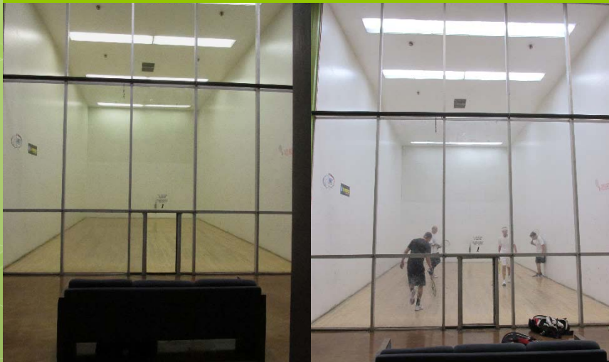
Before: 2LT8 60W