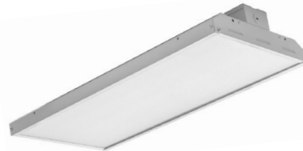
LED High Bay ENV-LED-HB7

The lighting quality was improved and the new LED lamps provide a zero-maintenance solution for the staff and in addition Fitness Evolution, Blackstone will save about $36,837 annually.