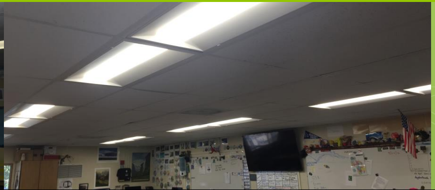
After – LED Troffer Retrofit KUDO