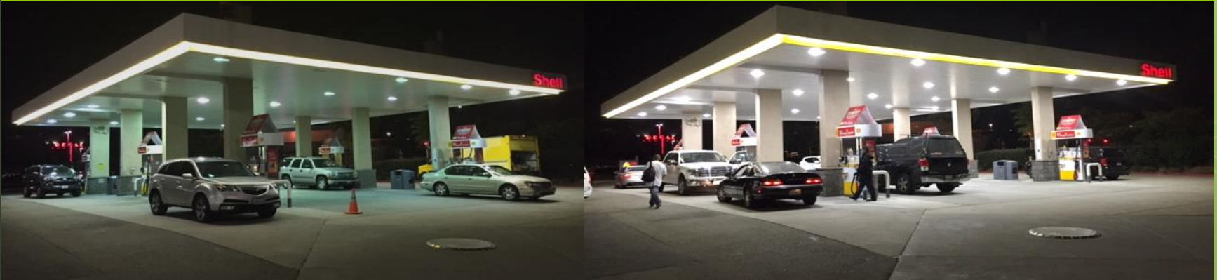
Before: 400W HID Shoebox